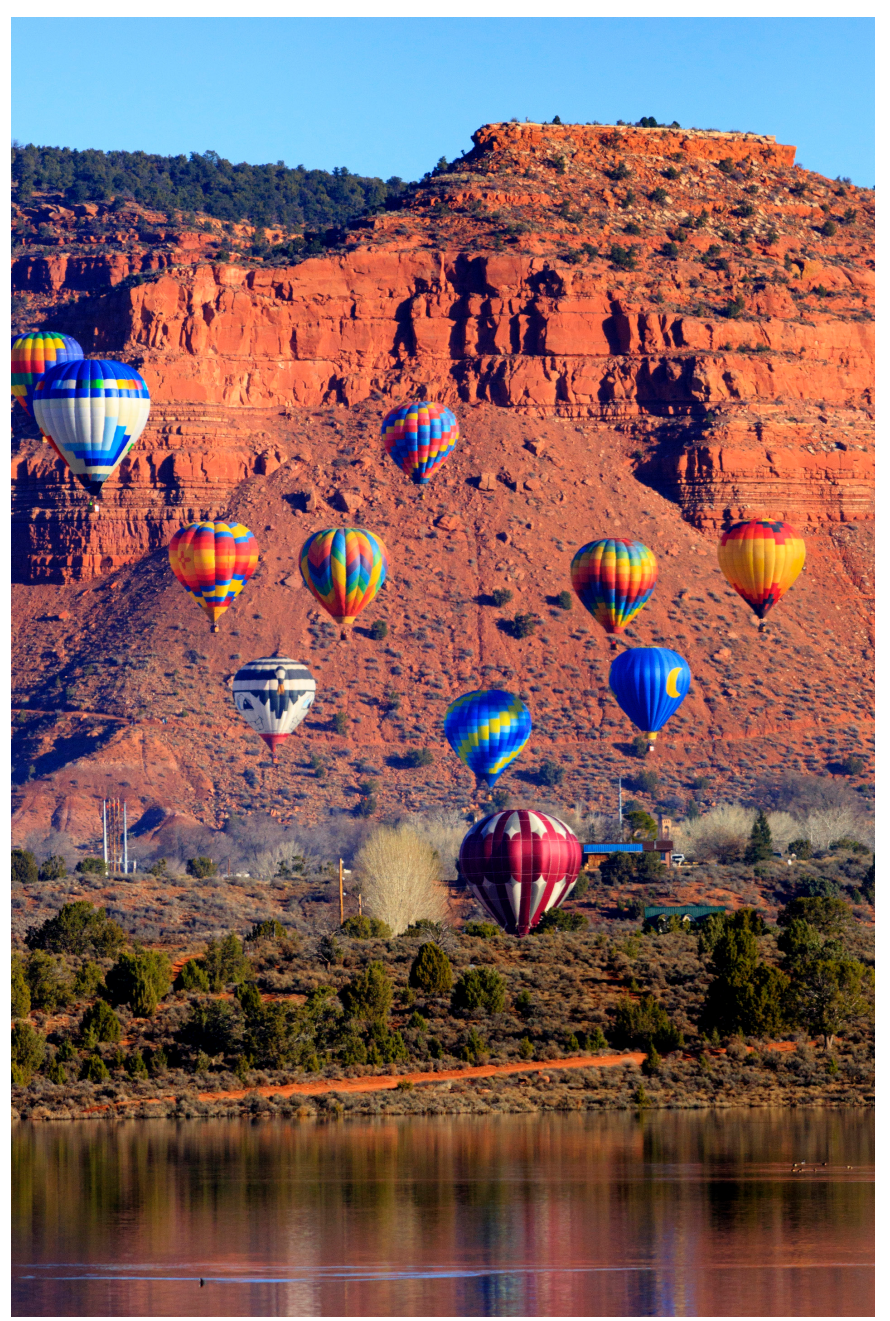
Balloons and Tunes Roundup, Kanab, Utah.

American Association for State and Local History. 250th Anniversary Program Handbook: Your Guide to Planning for the U.S. Semiquincentennial. Nashville, TN: American Association for State and Local History, 2024.