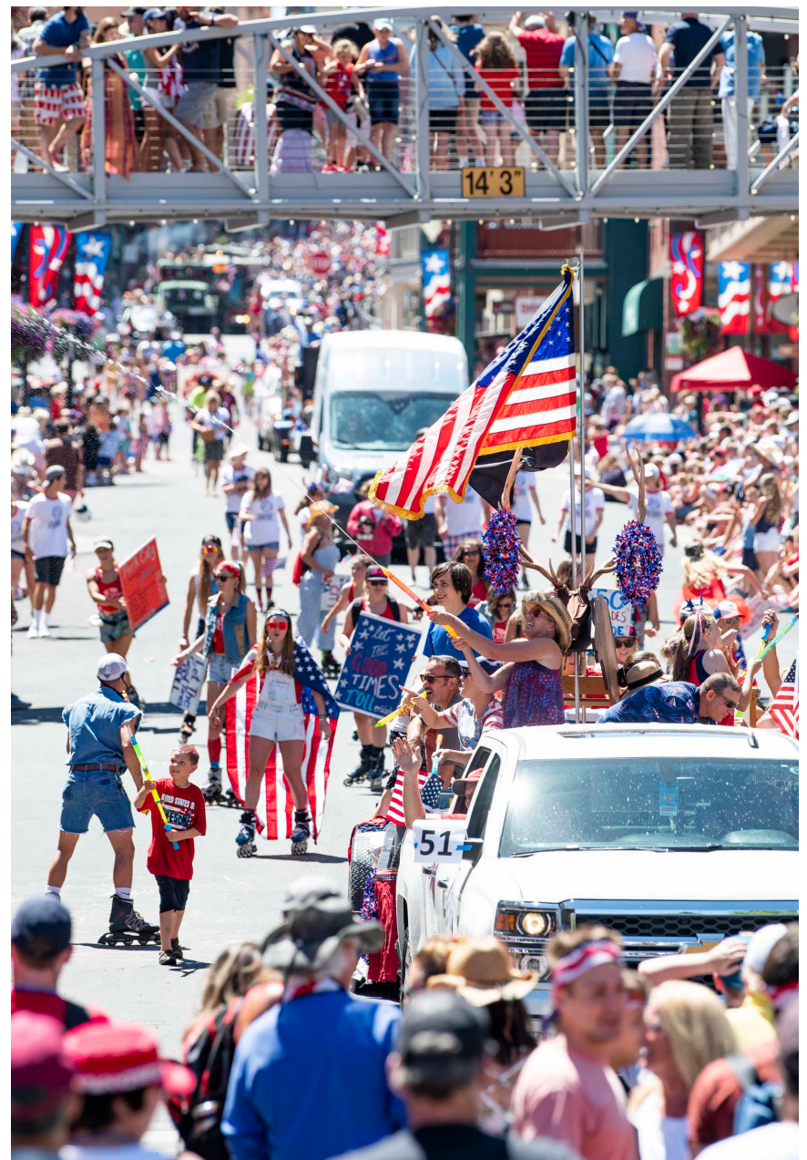
Fourth of July Parade on Lower Main Street, Park City, UT.