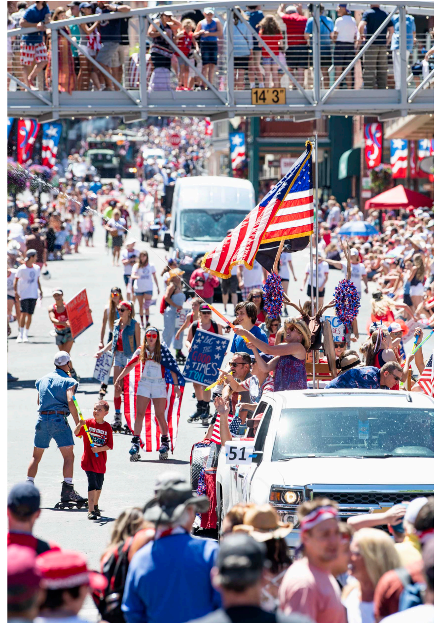
Fourth of July Parade on Lower Main Street, Park City, UT.