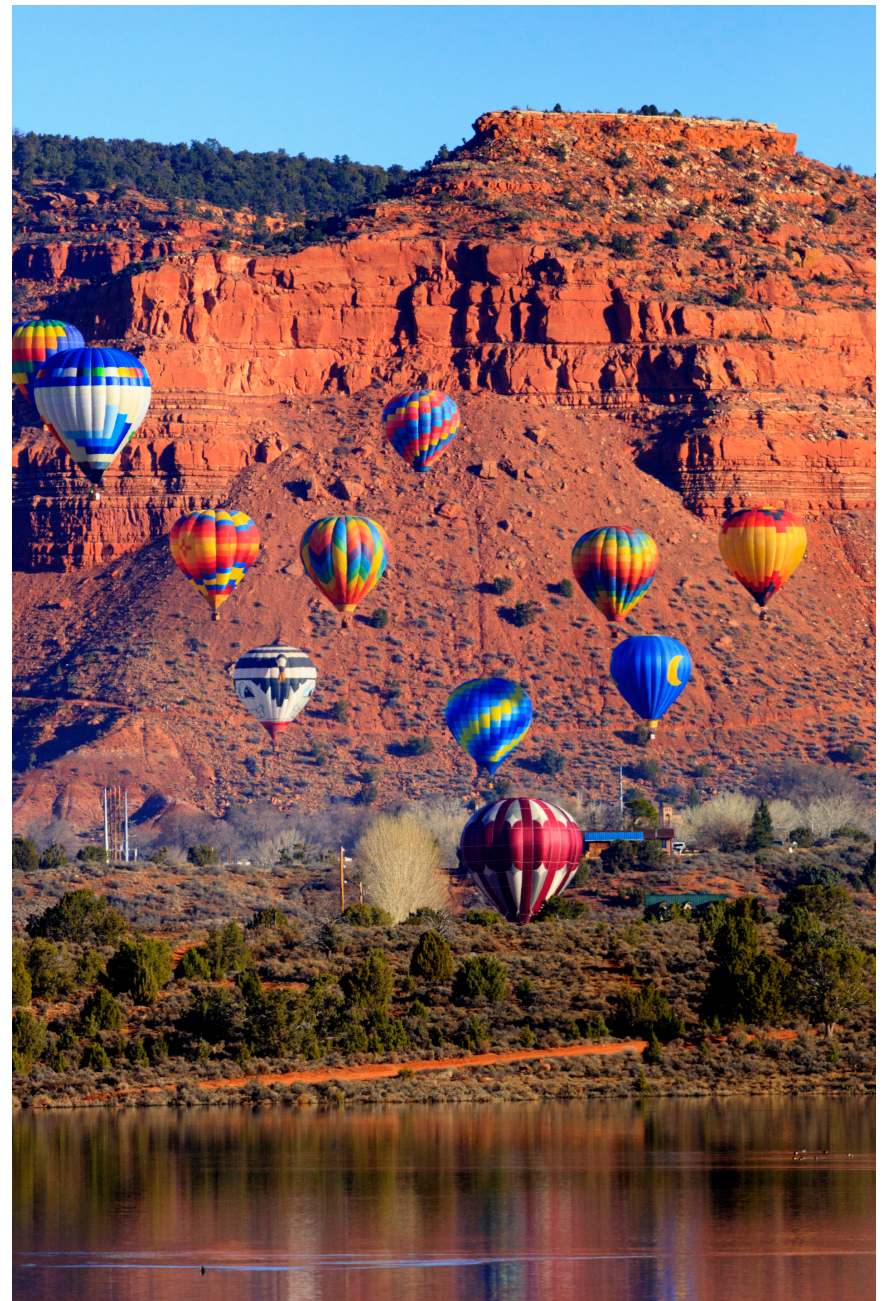
Balloons and Tunes Roundup, Kanab, Utah.

American Association for State and Local History. 250th Anniversary Program Handbook: Your Guide to Planning for the U.S. Semiquincentennial . Nashville, TN: American Association for State and Local History, 2024.