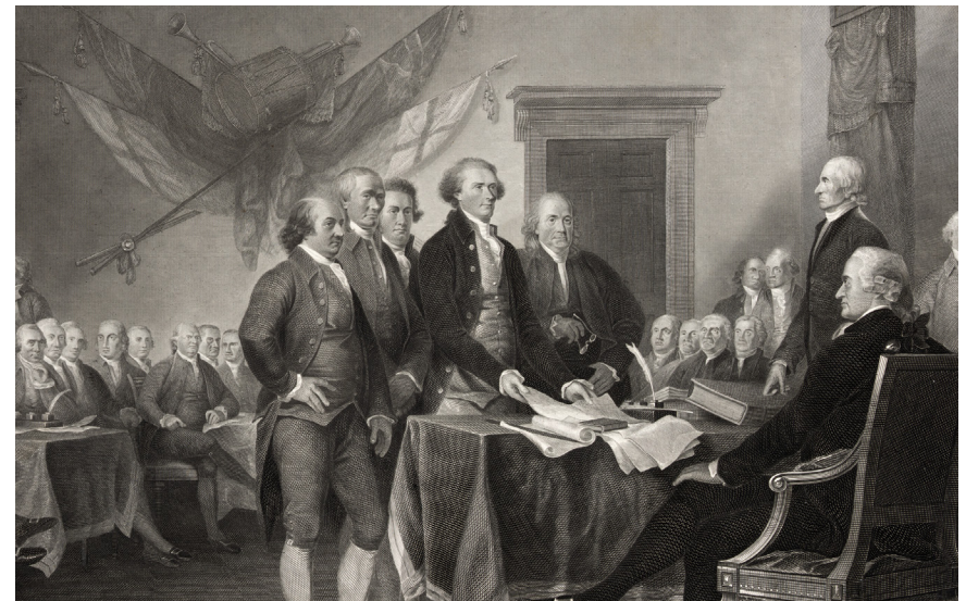
Detail from "Declaration of Independence" by John Trumbull.