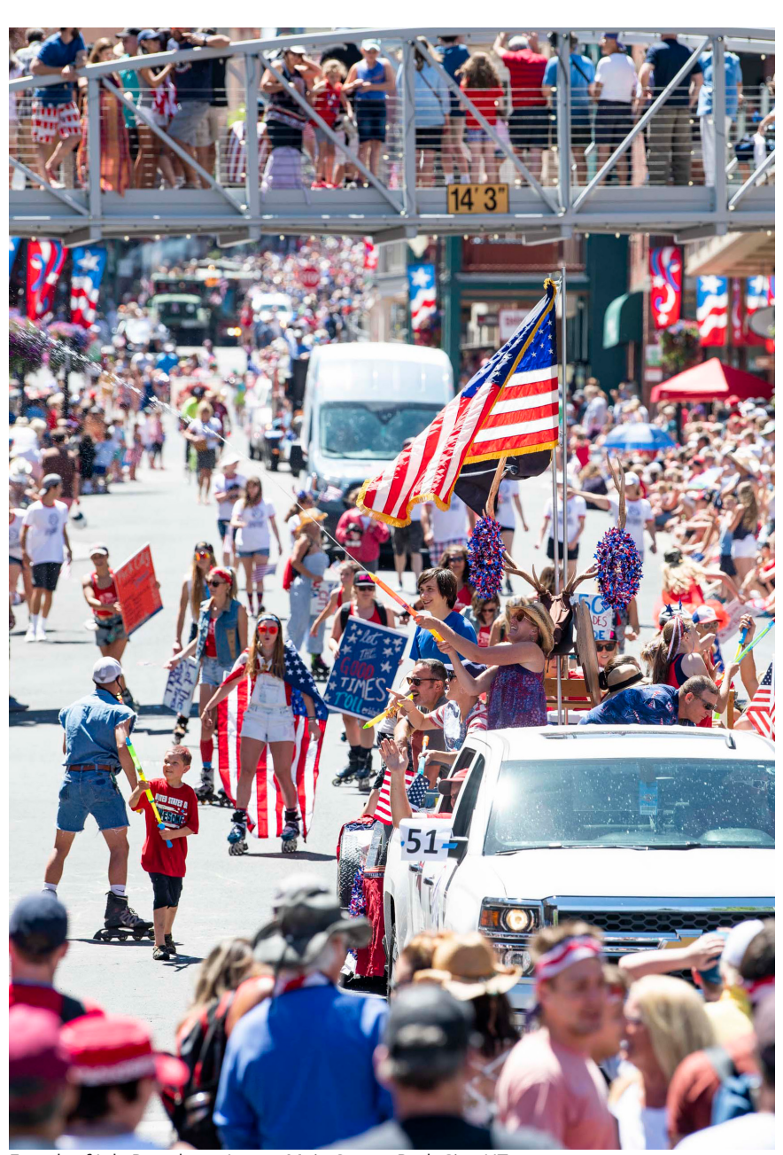
Fourth of July Parade on Lower Main Street, Park City, UT.