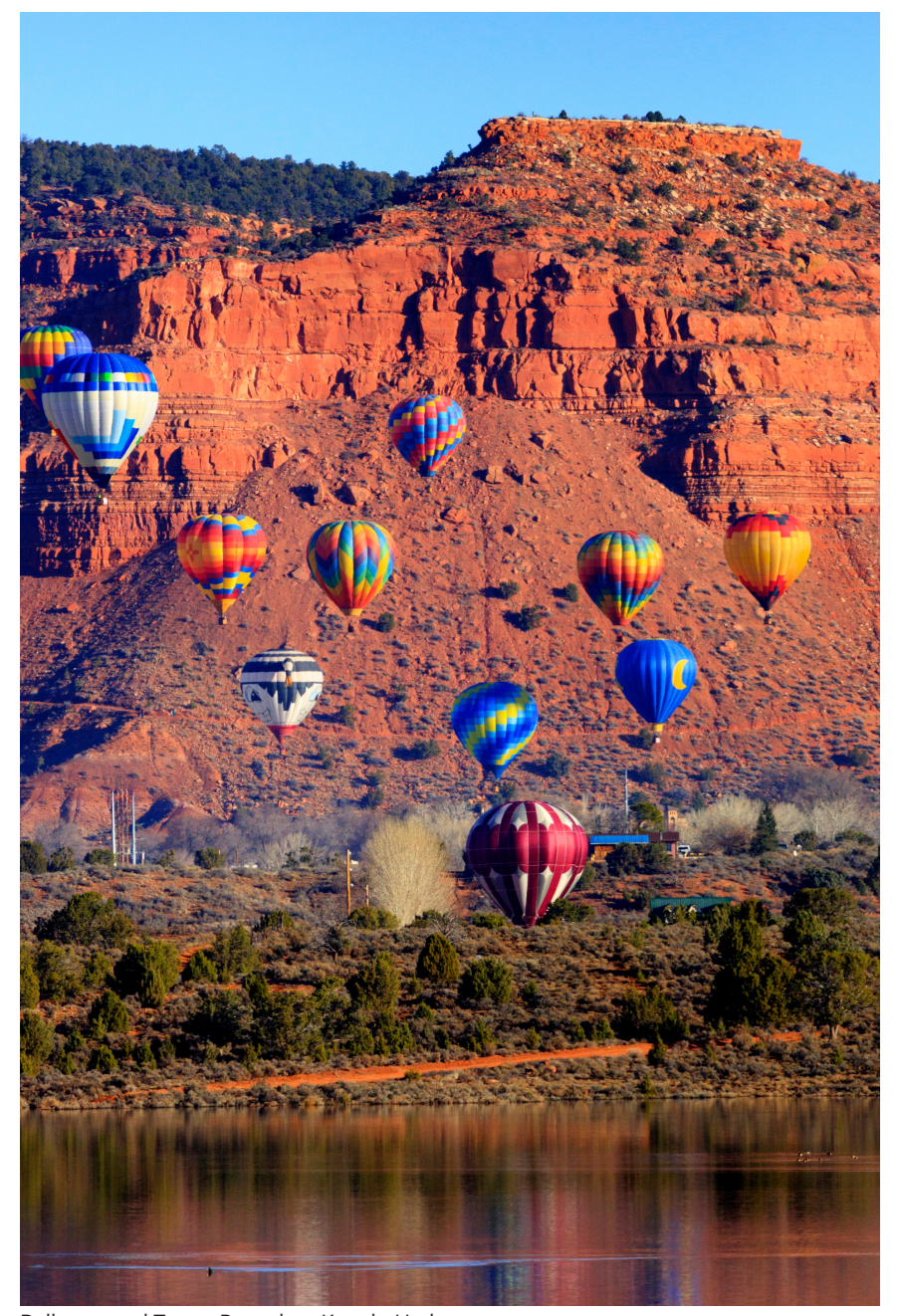
Balloons and Tunes Roundup, Kanab, Utah.

American Association for State and Local History. 250th Anniversary Program Handbook: Your Guide to Planning for the U.S. Semiquincentennial. Nashville, TN: American Association for State and Local History, 2024.