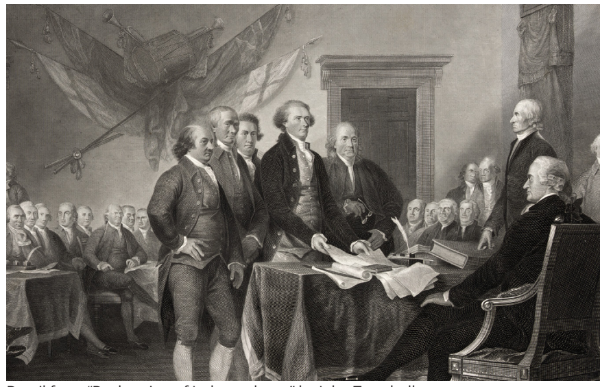
Detail from "Declaration of Independence" by John Trumbull.